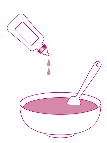
2 In a separate container, mix food coloring with one cup of water until you achieve the desired color.