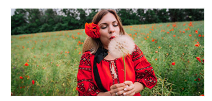
Health & Wellness