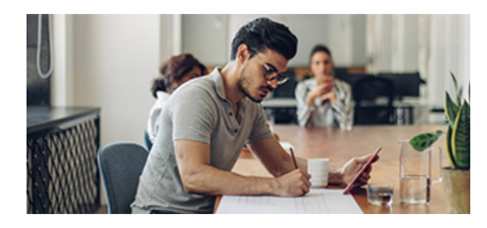
Chronic Pain, Tremors & Parkinson's